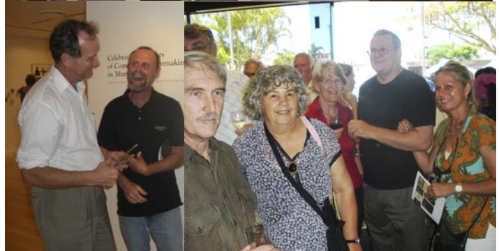
At the opening...a great time had by all